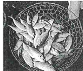
Fishing & Fish Processing (catching, sorting, packing, transporting fish)

This form and the data recorded within are protected to maintain family and child confidentiality. If you have any questions, please contact: