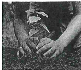
Forestry (soil preparation, planting, growing, cutting trees)