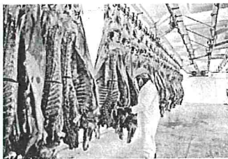
Processing & Packing (fruit, vegetables, chicken, eggs, pork, beef, lamb or other livestock)

CIRCLE all that apply below, even if the work was only for a short period of time.