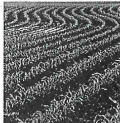
Agriculture or Field Work (planting, picking, sorting crops, soil preparation, irrigation, fumigation)